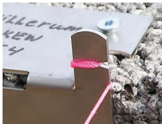
Wrap one end of a cord twice around the top slot and fasten the other end at the fixed point.