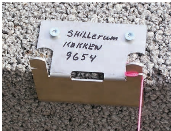
Write the measurement with a felt pen on the measuring plate.