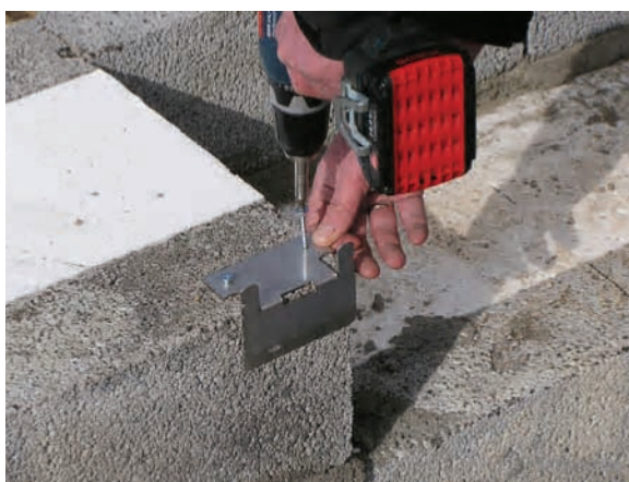
Fasten the measuring board with two nails or screws.